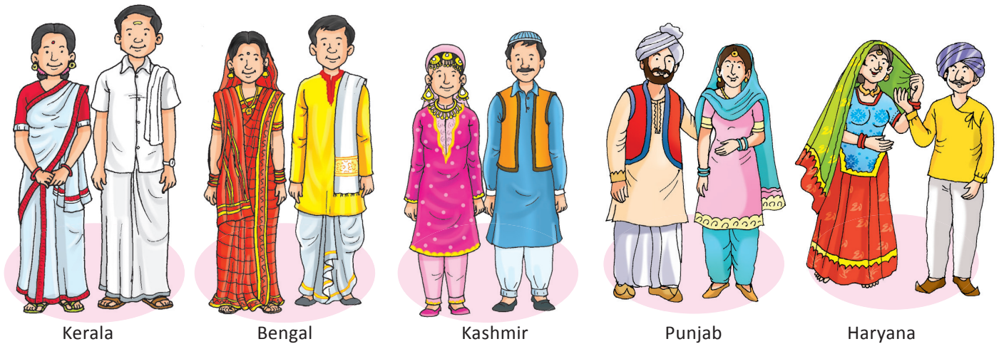
DIFFERENT CLOTHES WORN BY PEOPLE OF DIFFERENT REGIONS

People living in different regions wear different types of clothes. The kind of dresses they wear depends upon the climate and tradition of the region.